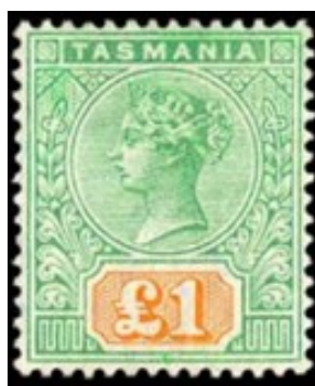
#61, 1878 & #85, 1892

printing of ten with a "Crown over A" watermark; the 2p, 4p and 6p were redrawn in 1911 and the 2p surcharged to 1p in 1912.