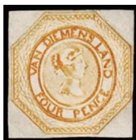
Tasmania #1 & 2b, 1853

The first postage stamps of Van Diemen's Land were seen in 1853 with 1p and 4p imperforate designs featuring Queen Victoria (as did all other stamps issued up to 1899). The Chalon portrait was featured on stamps first issued in 1855 in 1p, 2p and 4p denominations. In 1858 two new frame designs in 6p and 1sh denoms arrived with the new name "Tasmania." All five of those appeared imperforated, in two papers, unwatermarked and watermarked, and in several different perforation sizes and types until 1868 (Scott #4 – 47B). 1870 saw a new design with denominations up to 5sh with three different