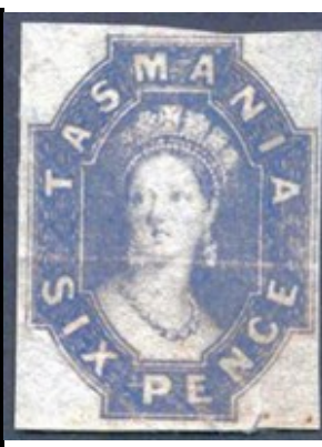
#12, 1860 & #15, 1865