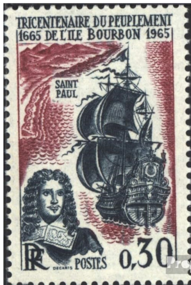
France #1134 Founder of Reunion