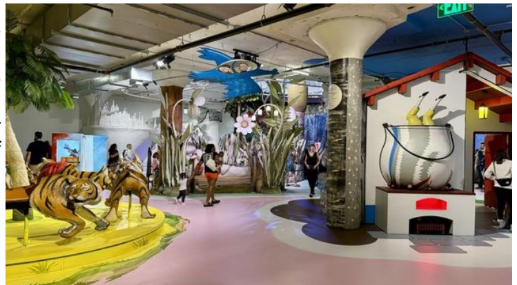
Inside the Rabbit hOle Museum