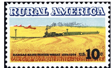
US #1506 Wheat Fields and Train

We didn't just drink bourbon. We ate at a wonderful Cuban restaurant one night and had the best Mojito's ever.